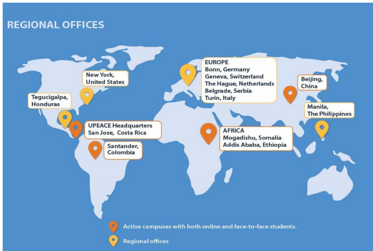
A map showing Upeace Regional Offices

A few years ago, the University was welcomed in Somalia after it started offering its courses. Before that, Somali students used to travel to Costa Rica and to the neighbouring country, Ethiopia, where the University has its Africa Regional campus for the continent.